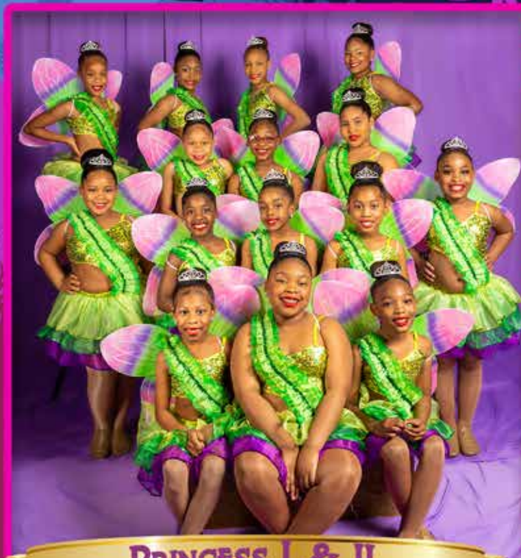
PRINCESS I & II